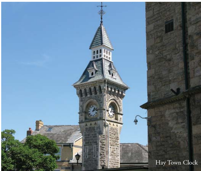
Hay Town Clock

Open Mon to Sat 9.30-5.30. Sunday 11.00-5.00